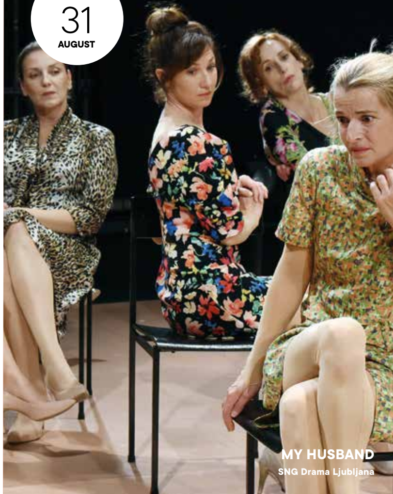
MY HUSBAND SNG Drama Ljubljana